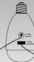
LED LAMP WITH DETACHABLE HANDLE